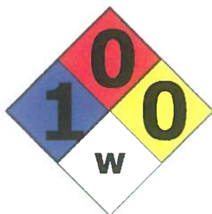
NFPA SCALE (0-4)